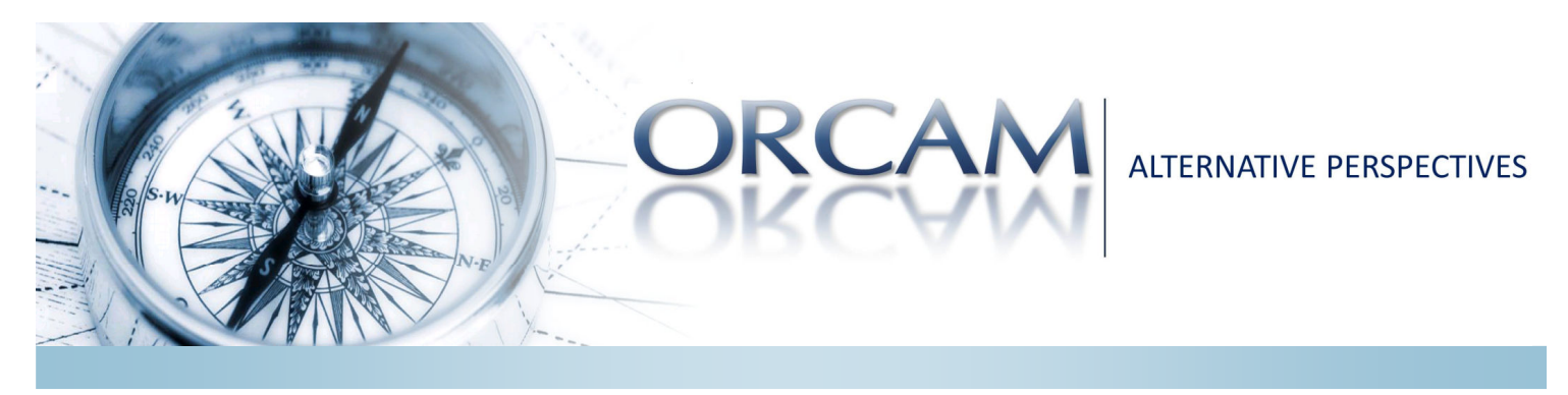
Macro Research & Strategy